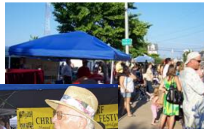
Setting up for 2 nd Saturday

On Monday, July 9, 2007, a team from FBC cooked and served dinner to an estimated 300 international students in Ocean City. Many of the student summer workers were from former eastern block countries, Russia and several of the Russian republics, Romania, Turkey, and a few from Ireland and elsewhere. For these young adults who are working hard to save for their education, these home-cooked dinners provided by area churches are often the highlight of the week. What a powerful way to witness of God's love for them!