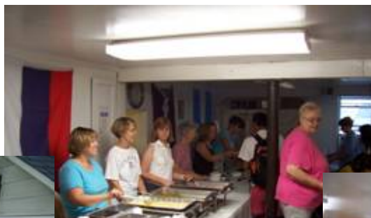
FBC members serving dinner.