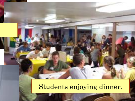
Students enjoying dinner.