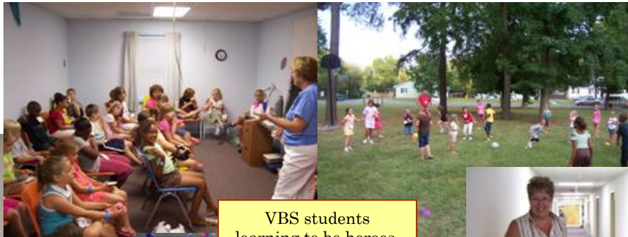
VBS students learning to be heroes.